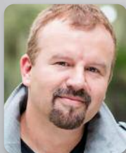
Mark Hall Singer, Song Writer for Casting Crowns and Student Pastor at Eagles Landing FBC